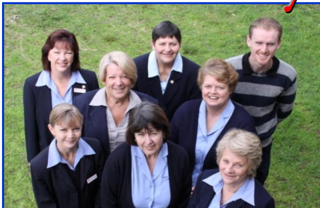
Tuncurry Senior Campus School Administration Support Staff