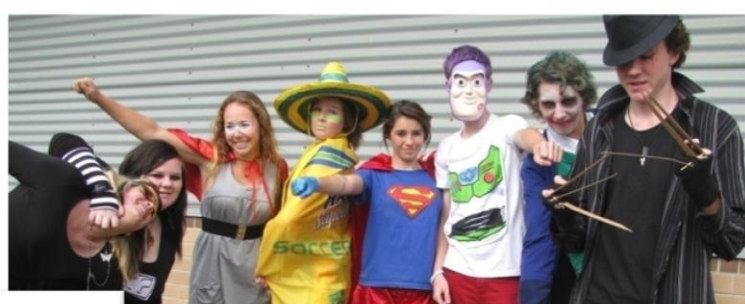
Motley Crew from Year10 Good and Evil