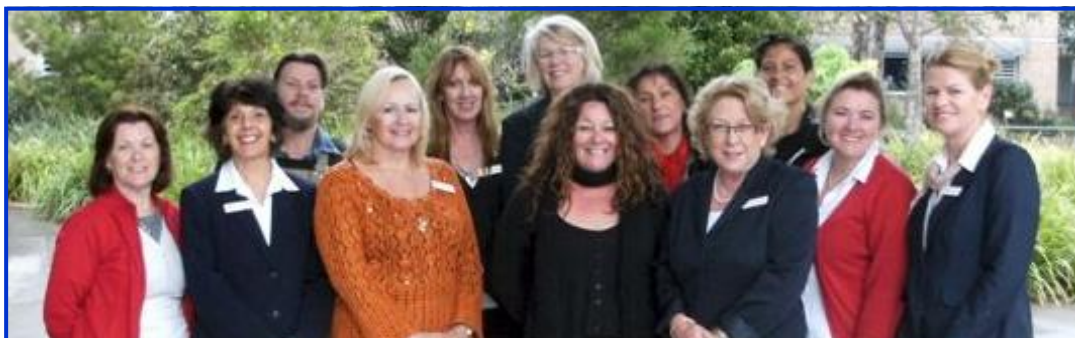
Forster Junior Campus School Administration Support Staff