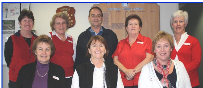
Tuncurry Junior Campus School Administration Support Staff