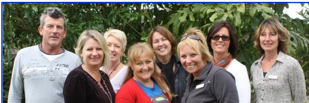
Tuncurry Junior Campus School Learning Support Officers