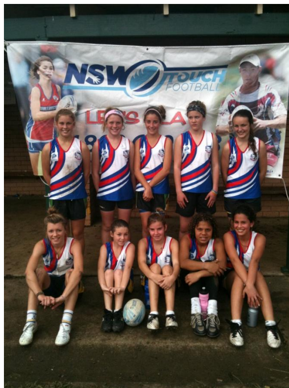
Above: Victorious Year 7 and 8 Girls Touch Football Team