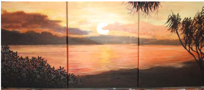
The Last Light Waves

"The sun at bay with splendid thrusts still keeps the sullen fold; And momentarily at distance sets, as a cupola of gold,..."