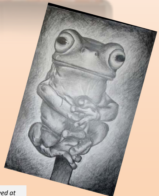
Examples of Year 11 Artwork to be displayed at the Open Day