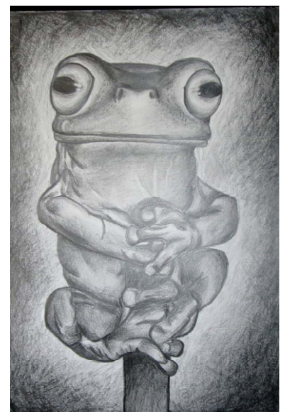
Through a Frog's Eyes

Through a Frog's eyes is a series of three lead pencil drawings based on the day in the life of a green tree frog.