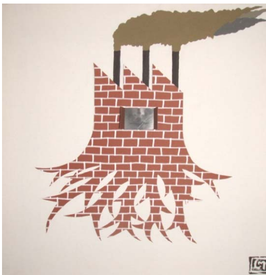
Louis Macdonald 6ix Billion

"Almost 1.5 trees have been cut down in the time it took me to produce 5 artworks."